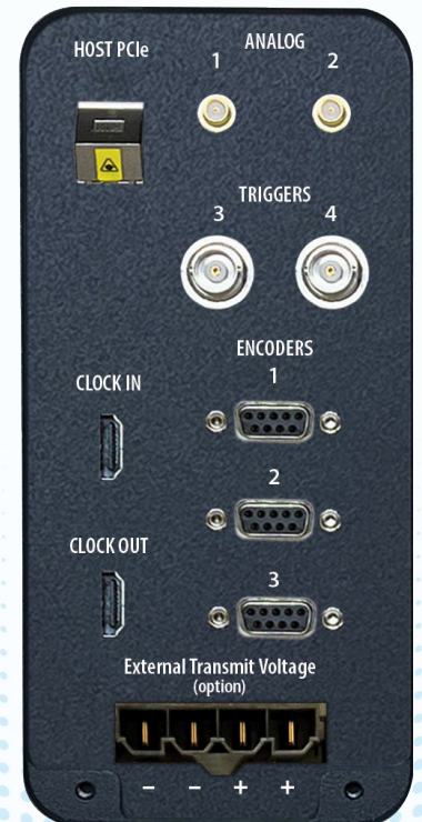
Vantage NXT I/O Panel