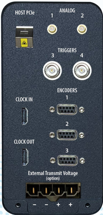
Vantage NXT I/O Panel