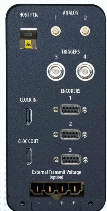
Vantage NXT I/O Panel