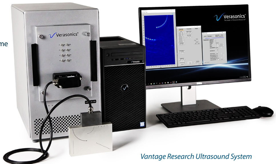
Vantage Research Ultrasound System